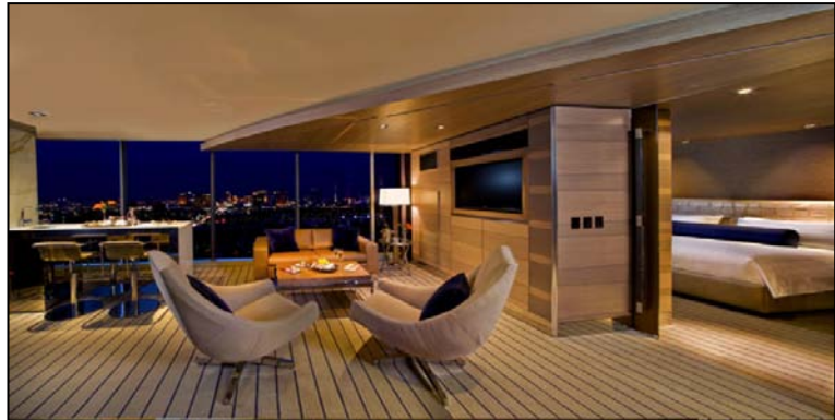
Luxury suites at Nevada's M Resort. At left, a loft suite; above, a flat suite.